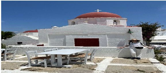
What is Geography?

Geography is the study of humans and people through space, throughout time, and how those spaces have shaped history. It's the "study of places and the relationships between people and their environments."